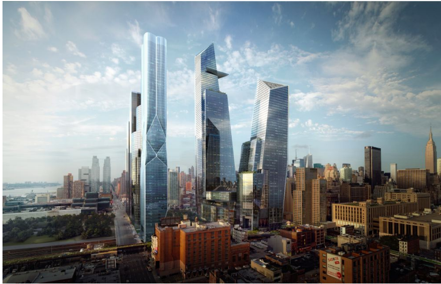
Overview of the eastern half of the Hudson Yards development.

The South Tower will be joined to its North Tower counterpart by a low-rise retail structure, called the Shops and Restaurants at Hudson Yards, designed by Elkus Manfredi Architects, that will run along 10th avenue between 30th and 33rd Streets.