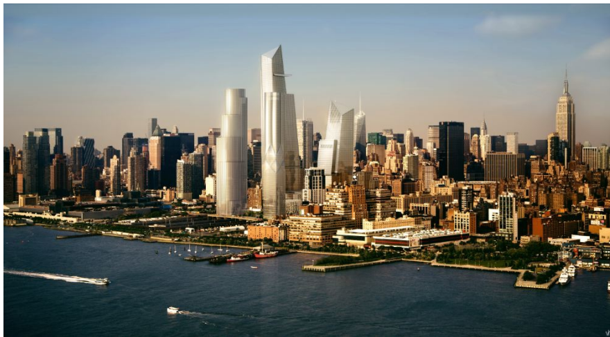
Distant overview of Hudson Yards and the western Manhattan waterfront.