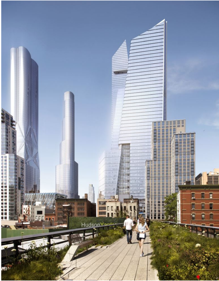
Rendering of the Hudson Yards towers as they would be seen from the High Line .