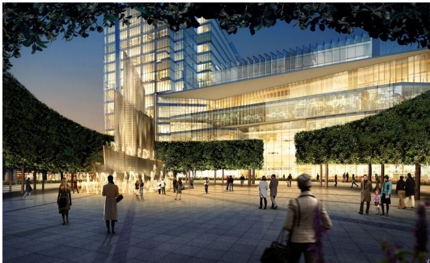
A public square will be located just west of the North and South Towers building cluster.

This building cluster will anchor the eastern edge of the development. To the west, a public plaza and park will extend as far as Manhattan's West Side Highway, flanked by a series of high-rise and mid-rise mixed use towers.