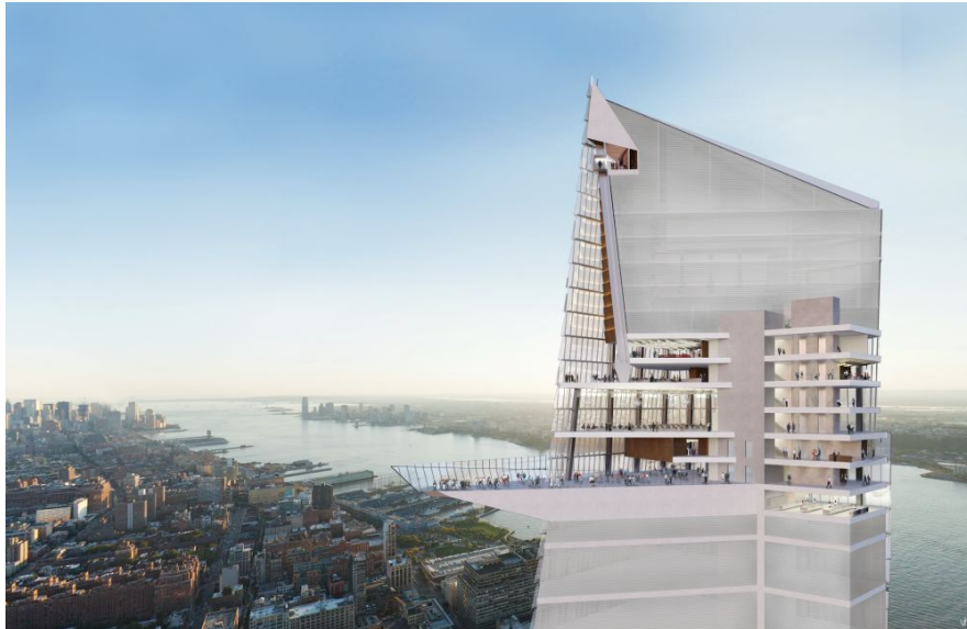
Section rendering through the top portion of the Hudson Yards North Tower, including the cantilevered public observation deck.

Upon its completion, the Hudson Yards development will comprise 12 million square feet (1.1 million square meters) of new construction and 12 acres (4.9 hectares) of public space.